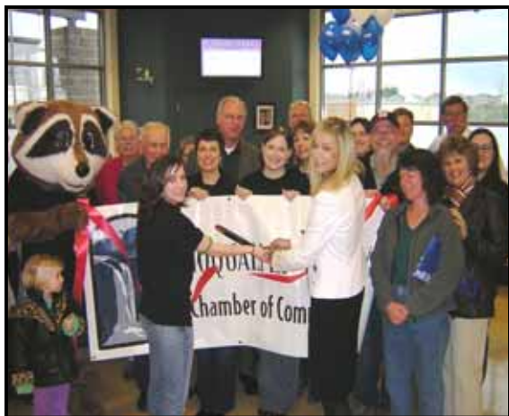
Sno Falls Credit Union SR Supermarket Branch Grand Opening April 8th!